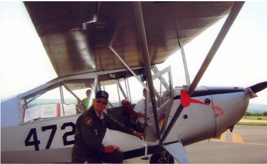
Youngsters get a look at the L-16 at Morgantown