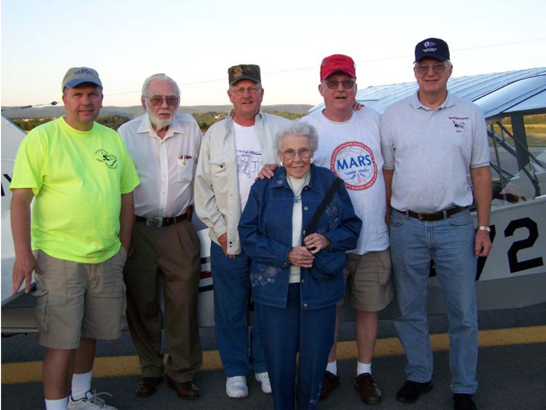
Cadets from 1940' and 50's after their L-16 ride.