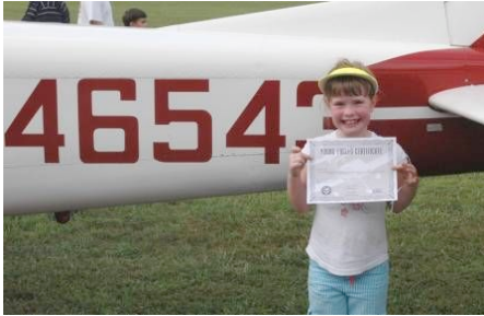
This is what it is all about!

would have been hard with the crew that does this at a drop of a hat.