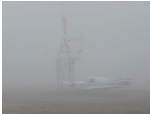
The FOG was Thick!

Minutes From The General Meeting Held On Saturday February 16, 2008 At Moontown Airport