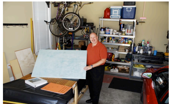
This is the front seat back – Wide Enough?

Examine every part for proper labeling. In cases where source documentation should be acquired (such as structural or power plant materials), ask for the paperwork before you buy. Do not accept material just because your supplier says "It's OK". Check with your designer.